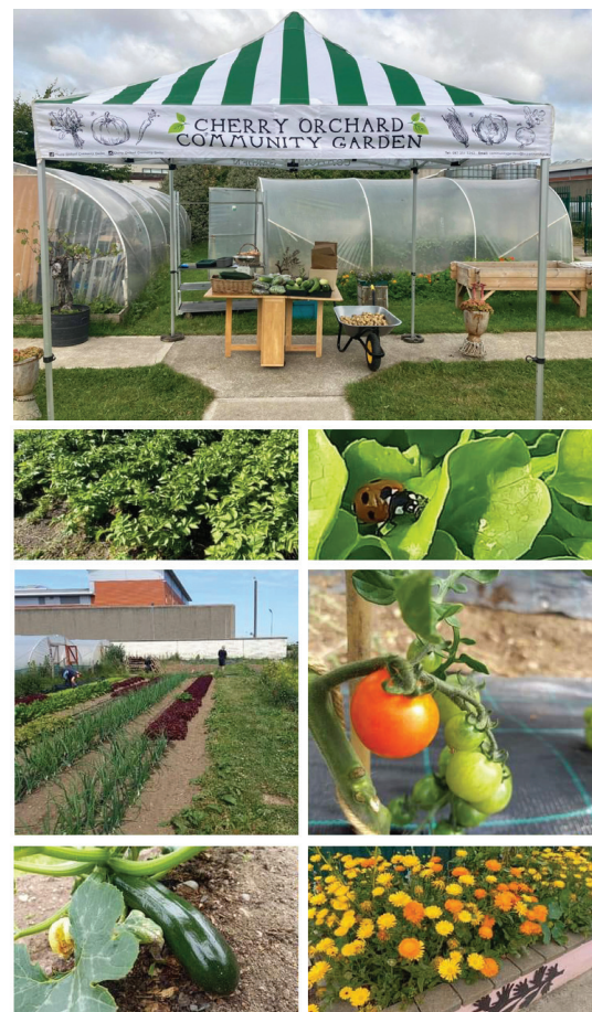
Cherry Orchard Community Garden

The Garden supported the Cherry Blossoms initiative in April by hosting talks on how to grow your own food and flowers as well as partnering with Cherry Orchard Integrated Youth Service on a day of events for younger people. In a similar vein, the garden linked with St Ultan's school to enable children to see seeds planted in pots, transferred to the ground, and grown.