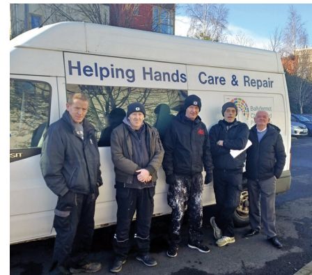
Helping Hands Team 2022

In 2022 Ballyfermot Chapelized Partnership relaunched the Helping Hands service in the Dublin 2,4 and 8 areas. BCP have 4 staff members on this team and developed new leaflets to advertise the service which were distributed in conjunction with the Guild of the Little Flower Meals on Wheels team. BCP Tús staff are also linking in with Alone and Friends of the Elderly to encourage more use of the service. The Ballyfermot service continued its success in 2022 and has 6 members on the team continuing to support older residents with home repairs, gardening, shopping, and other support needs.