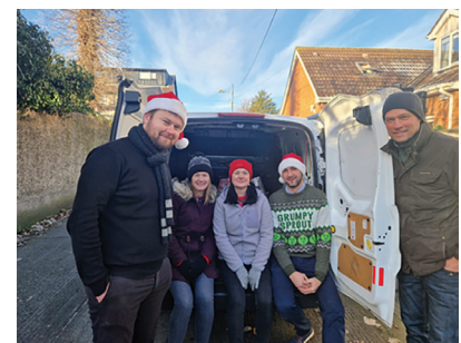
BCP staff delivering care packs to older persons