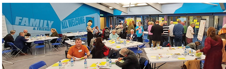
Cherry Orchard Planning Workshop