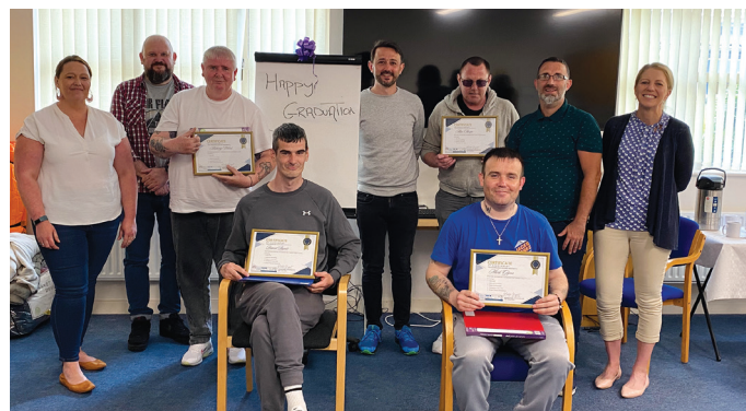
Careers Edge Graduation