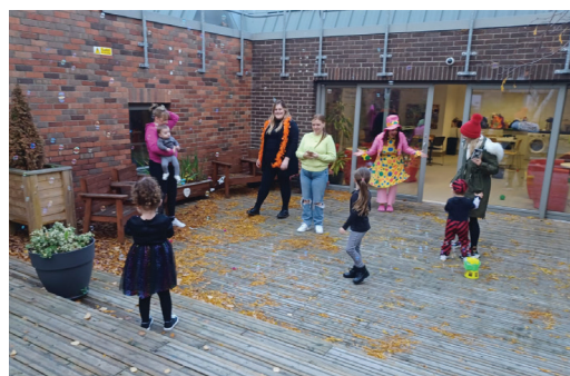
Parents & Children having fun in Ballyfermot Library

In collaboration with local schools and School Completion Programmes, the Lifeskills Programme was delivered again in 2022. This discussion and interactive programme helps children from 4th class to 3rd year, to explore and manage, in an age appropriate way, their decision making and choices, emotions and feelings, friendships, their talents. It gives children practical tips and tools on what they can do to manage very challenging dilemmas around smoking, drugs and alcohol when they occur. It also encourages the children and young people to stand up for children's rights and to be aware of the power and influence of advertising and social media on them. During the year 1,036 children part-took in Lifeskills, with 2 additional teachers being trained in how to deliver the Lifeskills Programme.