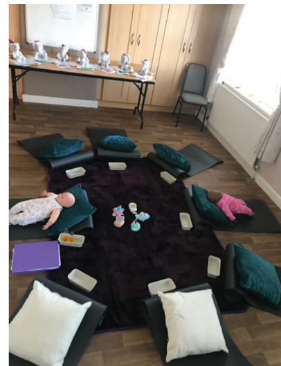
Getting Ready for Baby Massage

The Family Matters Area Based Childhood (ABC) Team had a very busy year 2022. There were many different early learning and supports on offer to parents and their young children across the whole community. These included a variety of programmes and initiatives such as Baby Massage, Parent Child Plus Home visiting programme, Parents Plus parenting course, PEEP parents and baby/toddler group, Incredible Years baby parenting programme, Parent and Toddler groups and creative workshops. All the groups show that when a parent plays and has fun with their child, the child learns, develops their speech and language and also advances physically and emotionally. This helps each child uniquely to grow up to be confident, independent and to reach their potential. Family Matters couldn't conduct its work without the collaboration with staff in TUSLA, the local Schools, Early Years services, FamiliBase, BTAP and all the community projects in the area.