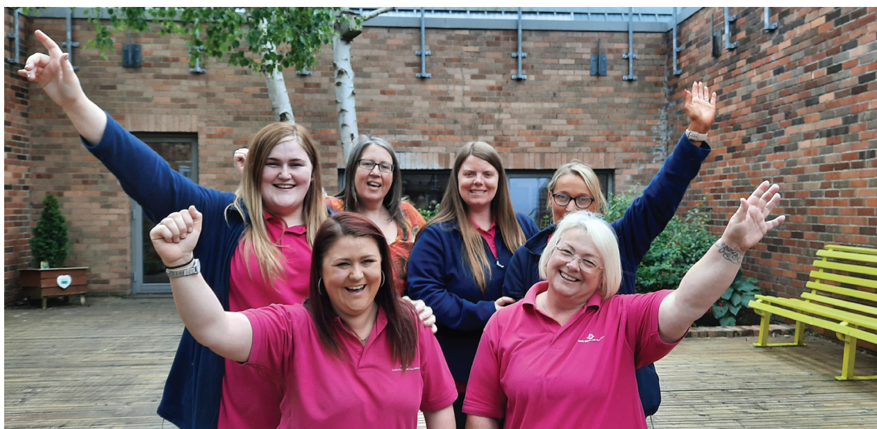
BCP Parent Child Plus Home Visiting Team

“ I moved to Ballyfermot into rented accommodation in 2016 with my husband and 2 children. Both my husband and I were unemployed and we got help with rent allowance from the social welfare. I got referred to the BCP to try help me get a job. I ended up going back to college and did SNA Level 5 and then went on to do SNA Level 6 and another module for Level 6. I also did relief SNA work in a number of schools in the area. My friend then told me about the BCP Family Matters Home Visitor programme. It sounded great, so I applied for the job was successful and then did the training to become a Home Visitor. The role was for 10 hours visiting parents and their child with a book or toy in their home twice a week. I started in Feb 2020 and a month later we went into lockdown, during that time we still kept contact with the families doing video calls and doorstep visits which was great. We also did a lot of online professional learning. I am now a qualified Home Visitor Coordinator, Infant Massage Instructor along with a lot of other courses we have done on attachment, child development and play. In October 22, my family finally got our 'forever home' and then as a result I was able to take on extra work as a Senior Home visitor. I am now working 20 hours a week and continuing with my education and in January 2023 my husband got a full-time job. ”