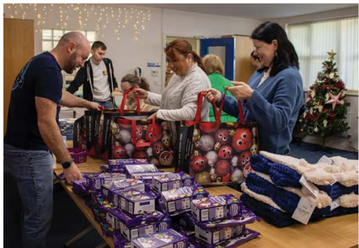
BCP SICAP Staff packing care packs for local older persons in isolation