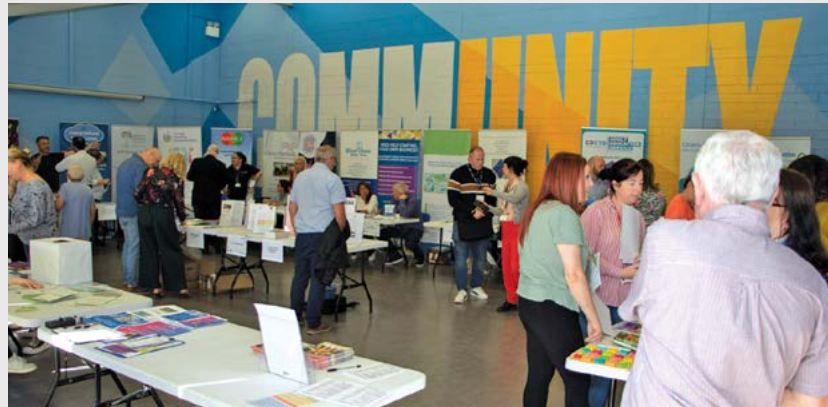
Cherry Orchard Information Showcase

The community development team coordinated an information showcase to bring community services to the local community and let them know what support are available in the area. There were 13 local organisations and 11 BCP services with stands.