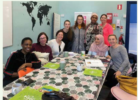
Group of Healthy Food Made Easy Participants

In 2023 BCP delivered 16 HFME programmes with 139 participants improving their cooking skills, nutrition knowledge and eating behaviours.