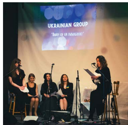
A group of women who moved to Ireland following the outbreak of war in Ukraine perform 'Diary of an Immigrant' at the Keep IT Lit Community Showcase event in Ballyfermot Civic Centre