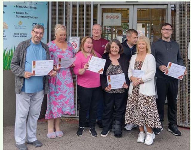
Group of We Can Quit Participants

BCP delivered 2 WCQ programmes in 2023 with 16 participants commencing the programme and 14 completing the programme and giving up smoking for good!