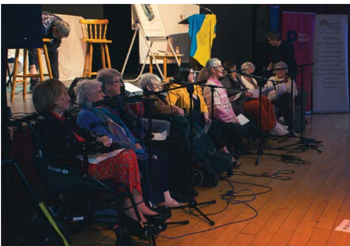
Residents of Glenaulin and Maryfield nursing homes participate in the Keep IT Lit Showcase Event

https://youtu.be/dbQqF3rj448?feature=shared