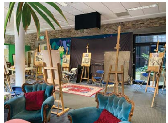
Tús Host Flux Studio

In the latter half of 2023 the BCP Tús team engaged U.C.C.I. the Ukrainian Crisis Centre Ireland and (as many Ukrainian refugees had now become eligible for the Tús programme) we secured 12 Tús placements for these clients through the self-referral process. This is of significant help to these clients in integrating into their Irish communities and improving their experience while upskilling and learning the English language.